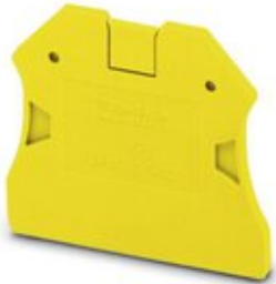
End cover, length: 47 mm, width: 2.2 mm, height: 39.8 mm, color: yellow

Please be informed that the data shown in this PDF Document is generated from our Online Catalog. Please find the complete data in the user's documentation. Our General Terms of Use for Downloads are valid ( http://phoenixcontact.com/download )